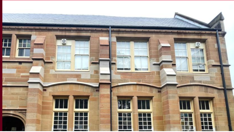
Image caption: southern side of Building A at Rozelle Public School